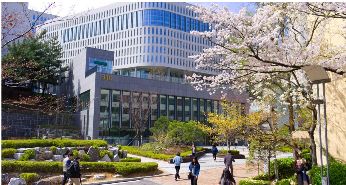
Centennial Building (Bldg. #310)